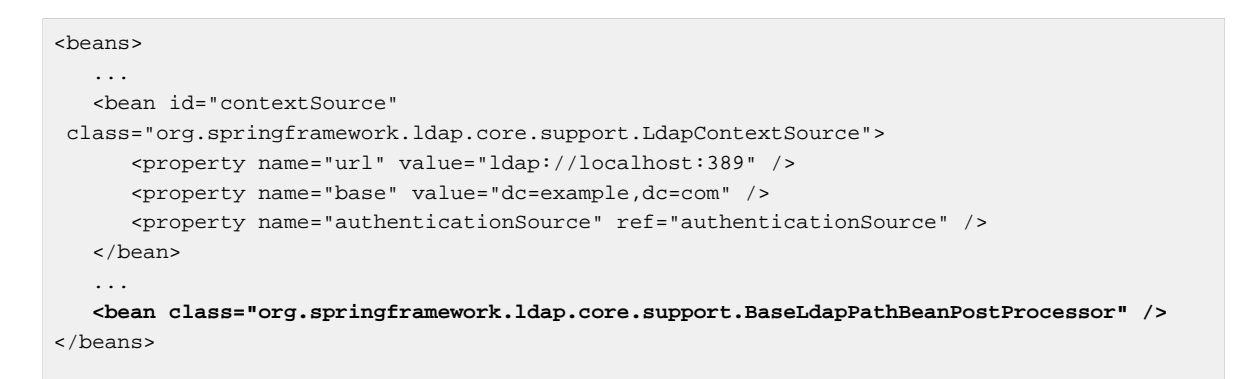
Example 8.4 Specifying a BaseLdapPathBeanPostProcessor in your ApplicationContext

The default behaviour of the BaseLdapPathBeanPostProcessor is to use the base path of the single defined BaseLdapPathSource (AbstractContextSource )in the ApplicationContext. If more than one BaseLdapPathSource is defined, you will need to specify which one to use with the baseLdapPathSourceName property.